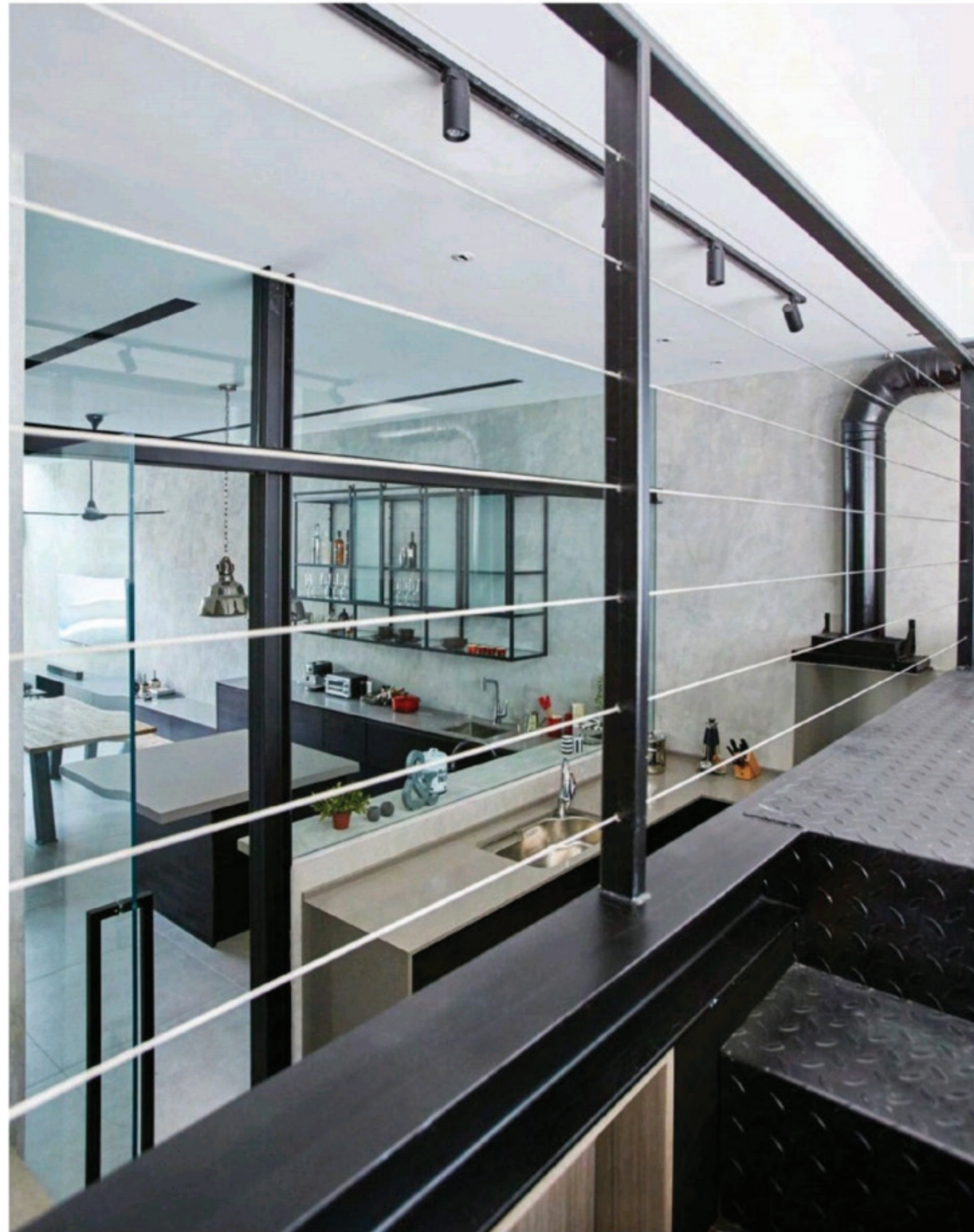
LEFT Ed used metal sheets to clad the flooring of the backyard, to complement the industrial style of the home.