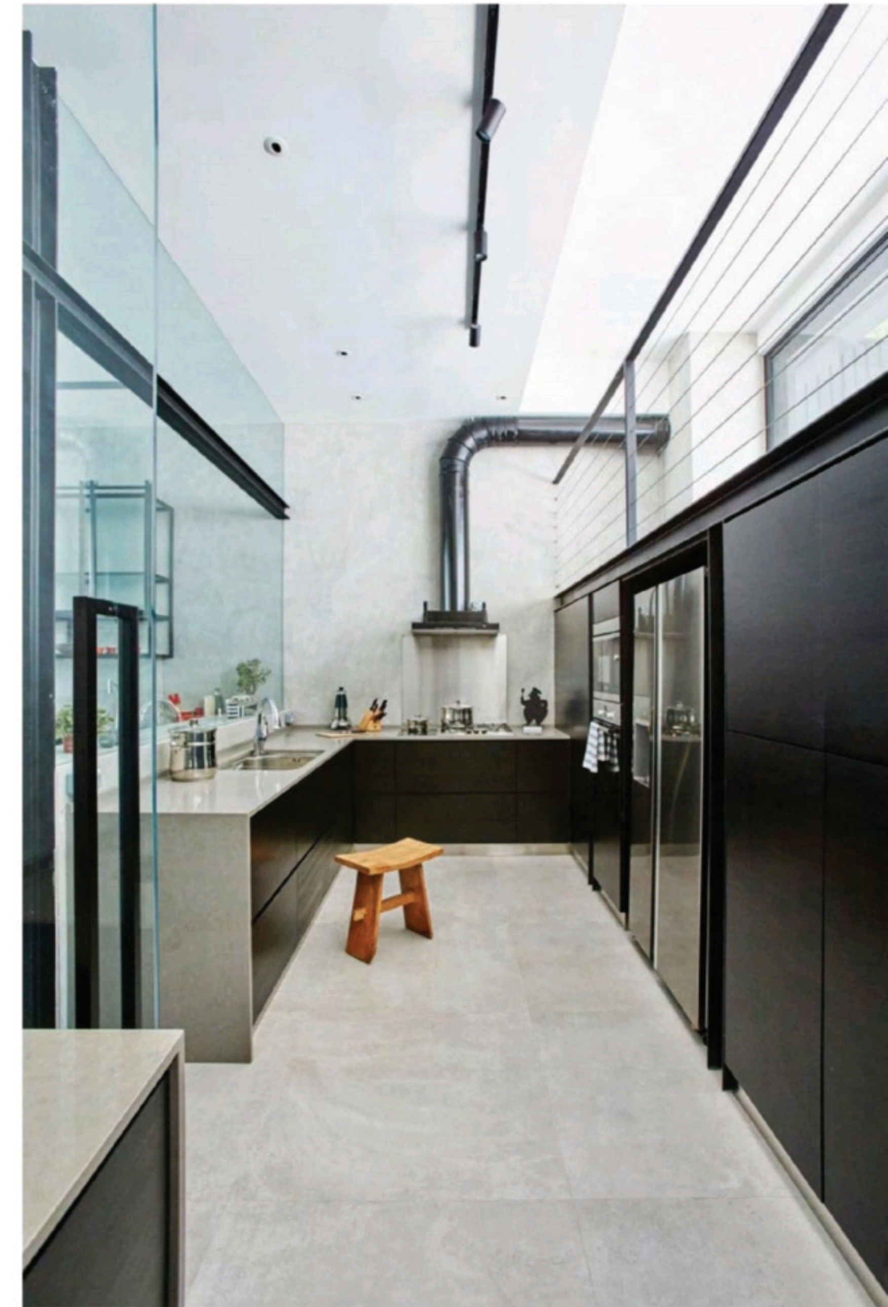
RIGHT To complement the industrial style of the home, Ed stripped the Bosch hood in the wet kitchen and exposed the duct.

The heart of the home, the dining-cum-dry kitchen, is where the homeowners spend most of their time, especially when they have guests over. The island has a grey Caesarstone countertop; the same material is used for the kitchen countertop, which segues into the TV console in the living room. "I wanted a seamless and clean look that extends all the way to the living room. ▶