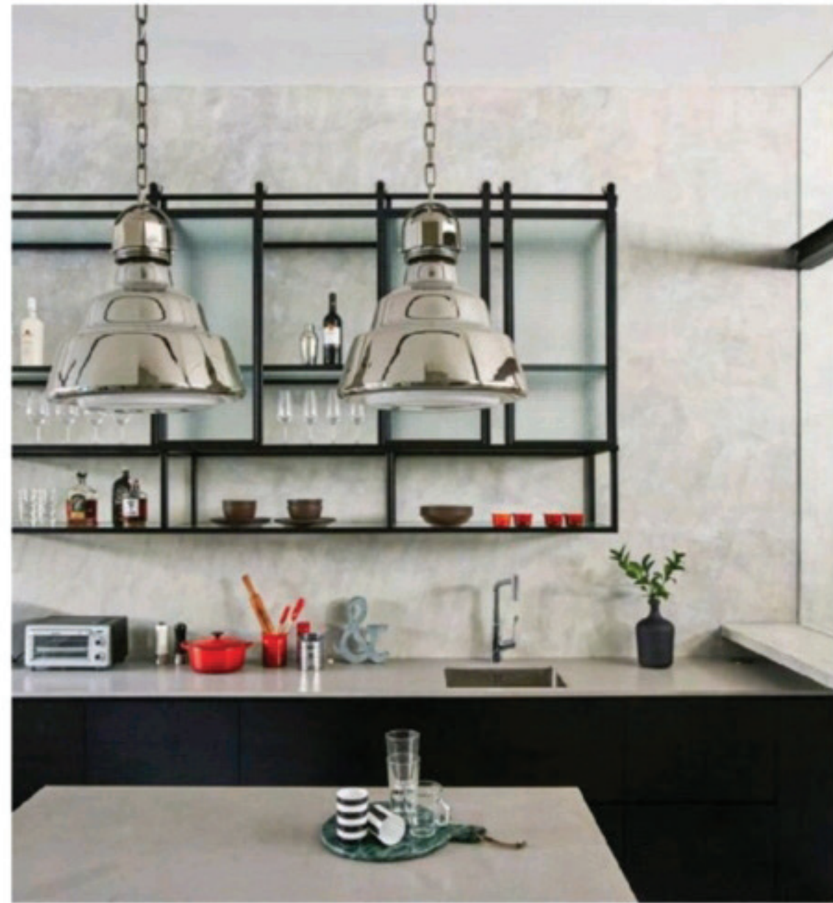
LEFT Ed customised the wall-mounted shelves in the dry kitchen for the homeowners to display their knick-knacks and alcohol. Foscarini lamps from Xtra hang above the kitchen island. Green marble board, striped cups, ampersand ornament, and black vase, all from Make Room.